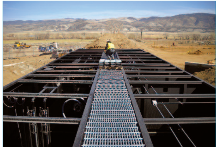
Installing the walkway grating on the Ashbrook unit