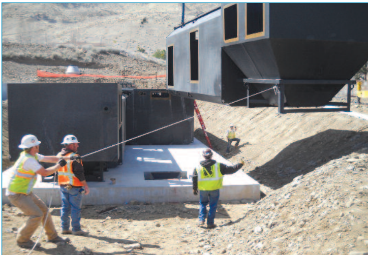
Installing the Ashbrook Treatment System Components

The second phase of work was focused on the Wastewater Treatment System and effluent dispersal which included installing: the 4,000 gallon filter tank and 8,000 gallon clear-